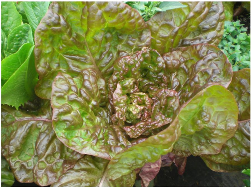
Continuity for all seasons