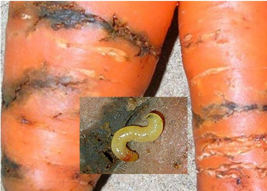
Carrot Rust Fly in Carrot